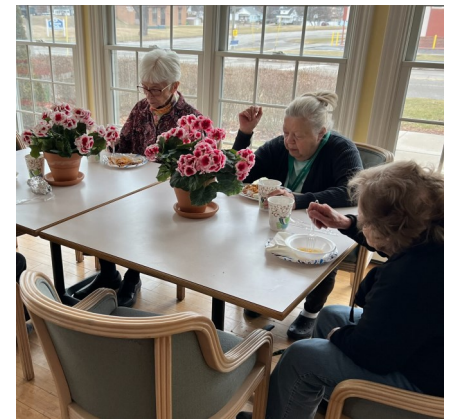
Residents enjoying the Mexican Fiesta!