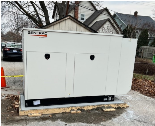
Pictured: Generator installation day by Ainsworth Electric.