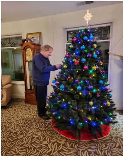
Residents pictured decorating for the holidays.