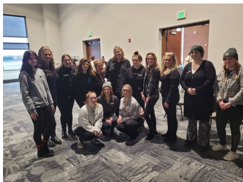
Pictured: Students from Paul Mitchell (left) Staff from Sanborn Gratiot Memorial Home (middle & right)

In addition to the pampering, a presentation was made on self care as a reminder to our staff to take care of themselves so they don't get burned out taking care of others. Ways to recognize compassion fatigue were given and ideas on how to take care of themselves first were also given. It was a great way to start a great year!