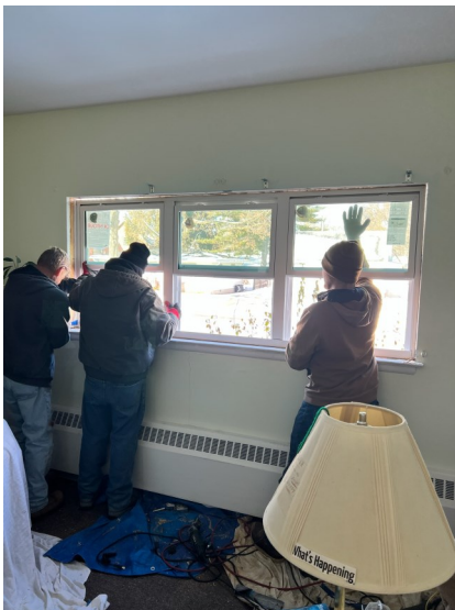
Workers from Nicholas Sears Construction install one of the new windows.